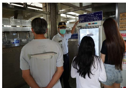
The narrator explains how the institution operates.