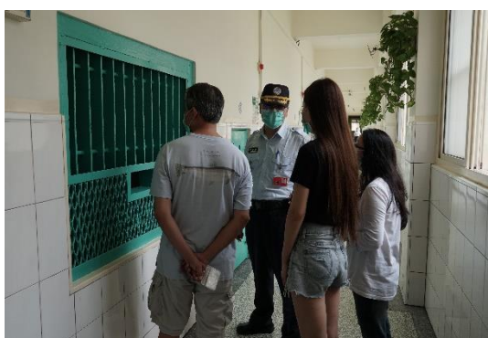
We appoint a person specially assigned for the visitation.